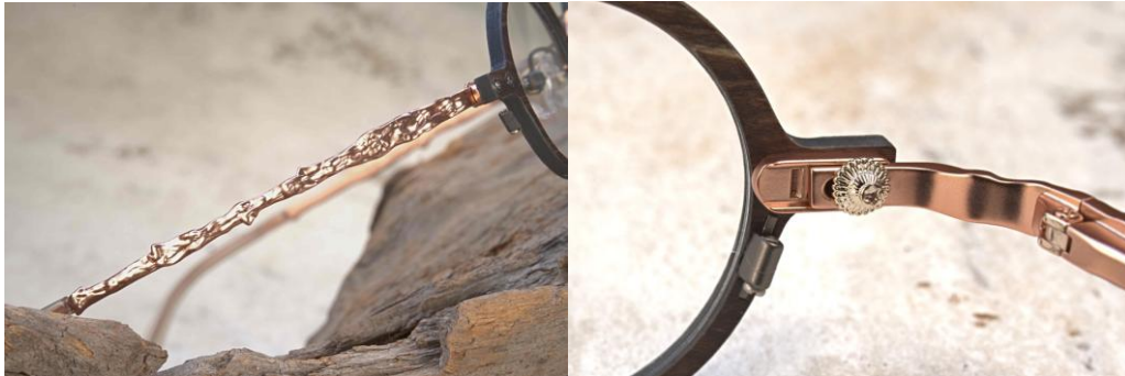
(Cedar-bark-inspired metal texture) (Samurai-inspired decorative pin)

SCION captures the tactile poetry of cedar through metal temples, echoing the rugged lines and intricate textures of Jomonsugi's bark. These patterns are paired with a Japanese design element inspired by the decorative pins once worn on a samurai's ceremonial attire. Traditionally, these metal motifs symbolised one's inner discipline and quiet resolve. In SCION, this element becomes a modern emblem of composure — an understated accent that honours the dignity and stillness embodied by the sacred tree.